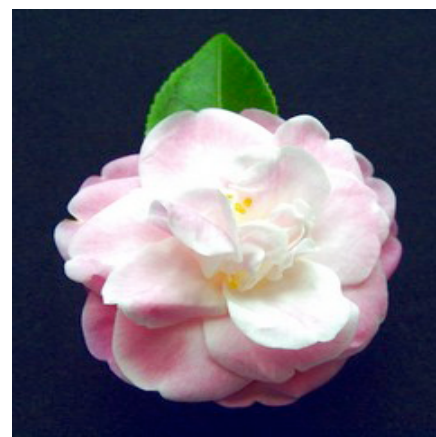
C. hybrid 'Sweet Jane'