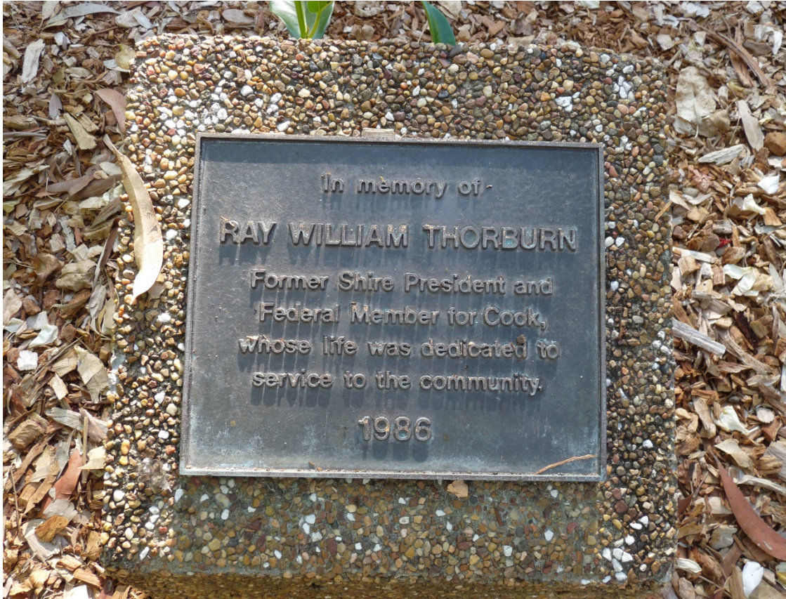
Ray Thorburn Memorial