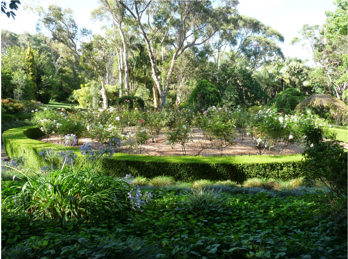
View of the Rose Garden during early summertime.

Garden beds 32A and B: Rose garden beds. This is primarily a Rose Garden with Garden bed 32B being a large perimeter Garden bed. Camellias are being trialled in Garden bed 32B. An outstanding specimen of Weeping Mulberry ( Morus alba ‘pendula’) grows in the lawn just to the right, as one enters the arch entrance.