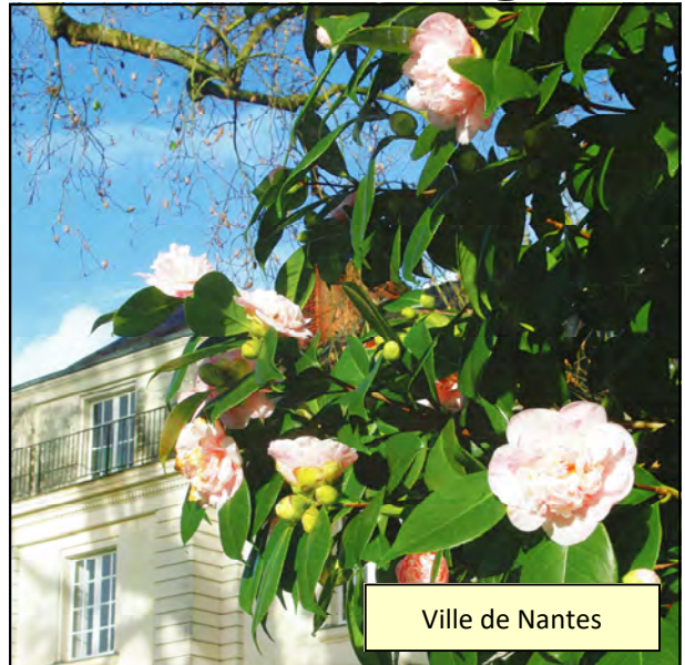
Ville de Nantes